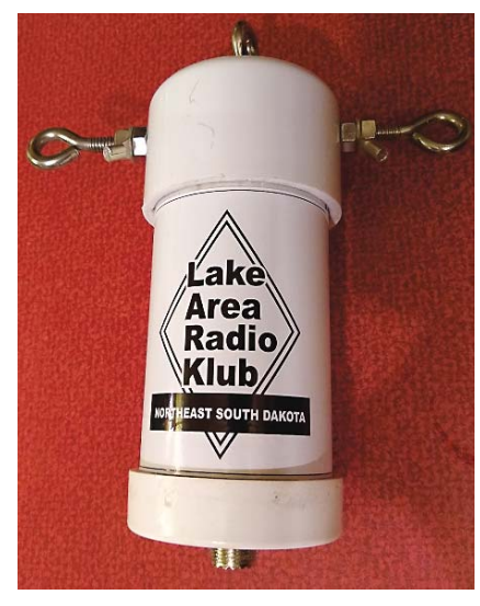
Figure 3 — The antenna connection on the outside of LARK's balun.

The use of coax instead of paired lead wire kept winding distributed capacitance low for use on 10 meters (our tests show that the balun even works well on 6 meters). A test jig (see Figure 2) was developed to test amplitude and phase balance over the applicable frequency range. Because most network analyzers are single-ended (unbalanced), the use of matched resistors in the test jig allowed us to test for both amplitude and phase balance.