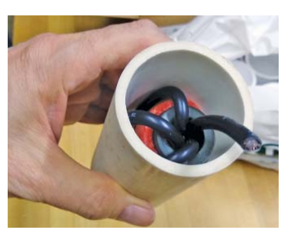
Figure 1 — LARK's balun design includes four turns of RG-8X coaxial cable through a 1.2-inch OD ferrite sleeve (about 2 inches long), made from Fair-Rite's #31 material.

The Lake Area Radio Club used this balun design to replace 40-year-old center insulators.